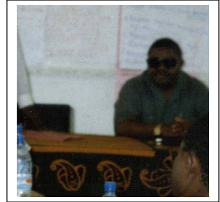
The DC after delivery of his speech

The District Commissioner of Rufiji District, Brigadier General Sylvester Hemed, officially opened the workshop. In his opening remarks he thanked all the organizers of this important workshop for recognizing the important role of women in the management of the natural resources. He also expressed his appreciation for the good attendance of community leaders from different levels of management as well as village representatives. He called upon all the Participants to become good ambassadors by taking back what they will learn from the two days workshop.