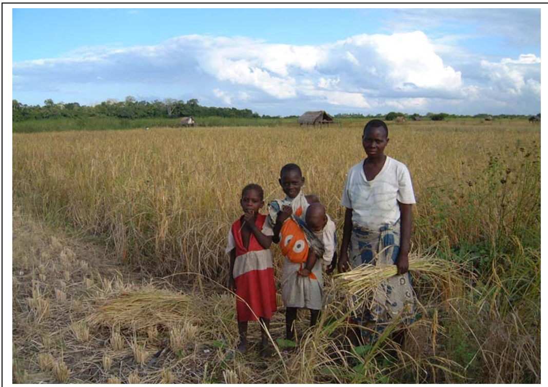
A woman and her girl-children harvesting rice at Mbunjumvuleni village